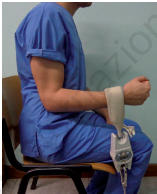
Fig. 1. The test is performed with the patient seated with the arm at the side, the elbow at 90^\circ of flexion and the forearm in neutral pronation/supination. The patient is asked to flex the affected limb against the resistance of a dynamometer and to maintain the maximal resistance for five seconds.

The BRF test was performed with the patient seated (arm at the side and elbow flexed at 90^\circ ). The patient was asked to maintain maximal resistance at 90^\circ of elbow flexion for five seconds (Fig. 1). A digital dynamometer (Kern & Sohn GmbH, Balingen, Germany) linked to the ground was used to record