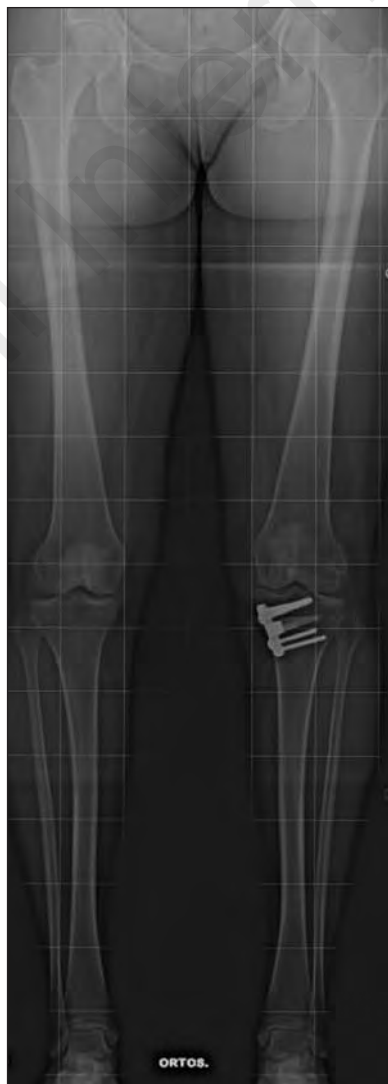
Fig. 4. Weight-bearing long-standing AP radiograph at the two year follow-up: the correction is maintained, the osteotomy is consolidated and the articular surfaces are intact.

Direct visual assessment during open surgery showed integrity of the popliteus tendon and the lateral collateral ligament, although the latter was loose; the other posterolateral capsular ligamentous structures were not clearly identifiable because of the presence of fibrotic