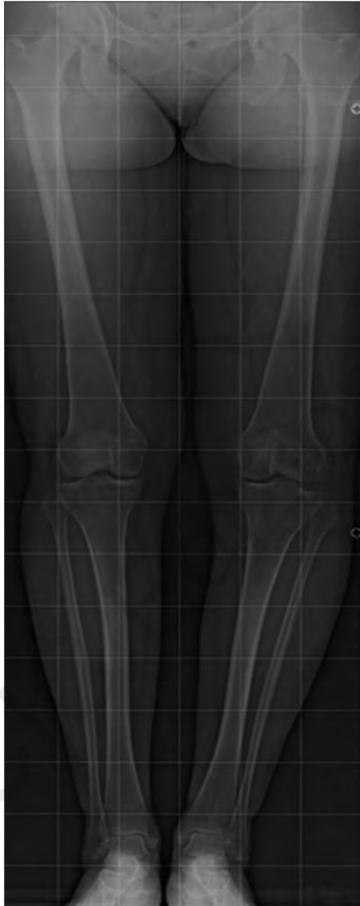
Fig. 1. Weight-bearing long-standing AP radiograph: varus malalignment of the limb due to the insufficiency of the lateral capsuloligamentous structures (arrow).

The patient agreed to undergo a complex two-stage sur-