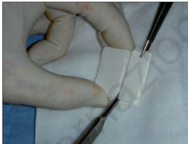
Fig. 1. MaioRegen scaffold.

All the patients gave their informed consent prior to their inclusion in the study, which had ethics committee approval and was performed in accordance with the ethical standards laid down in the 1964 Declaration of Helsinki and its subsequent amendments. Exclusion