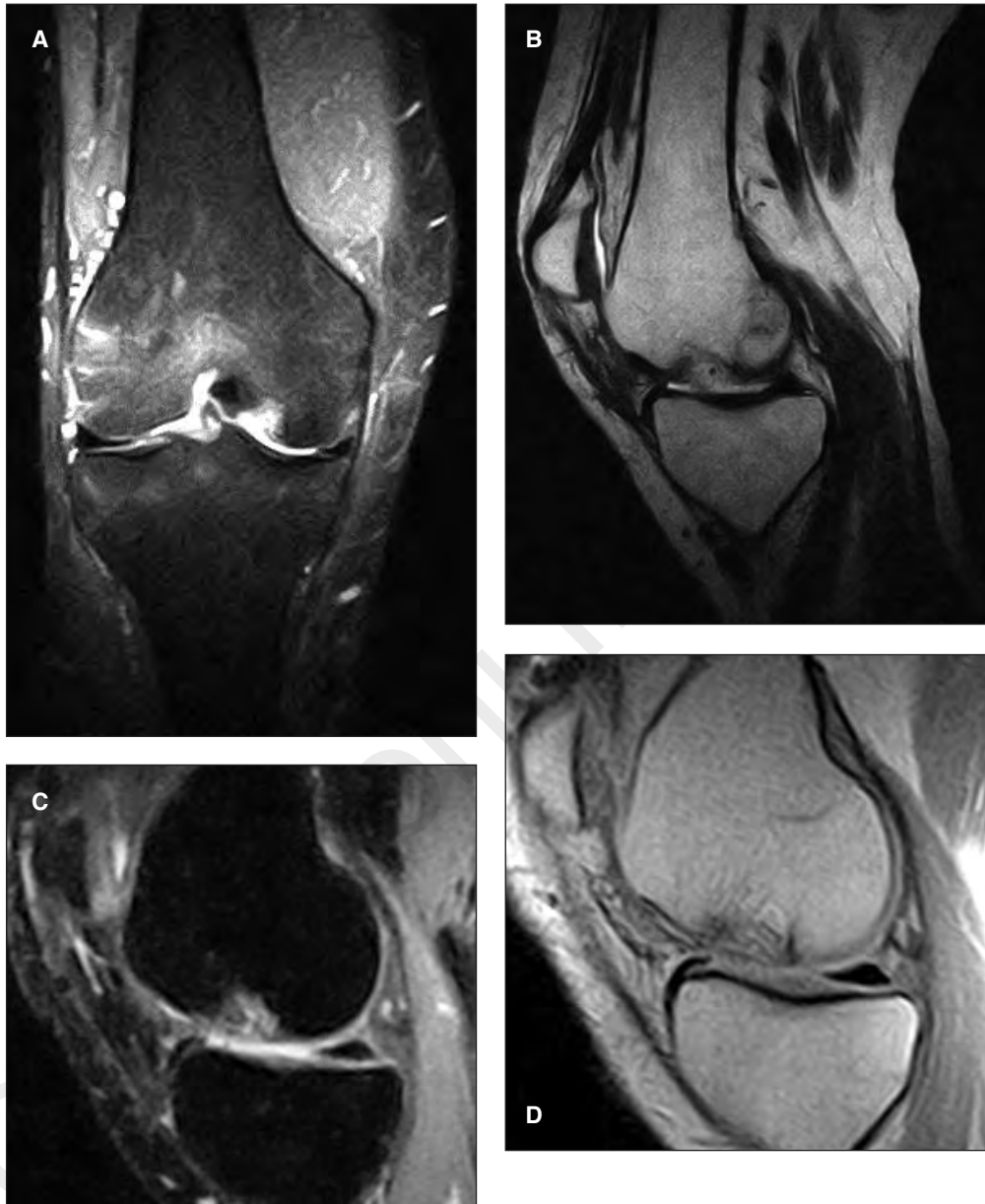
Fig. 3. Postoperative imaging of MaioRegen implantation. A-B: MRI follow-up at one year. It is possible to note the scaffold in situ and the ongoing differentiation process. C-D: MRI follow-up at two years. The scaffold is still recognizable at subchondral level, but the cartilage layer appears continuous and the subchondral bone shows no signs of edema.

fold itself) of bone marrow stem cells (31, 32). Various experimental studies, both in vitro and in vivo , have been published (27,30), but in our experience only two scaffolds are available in clinical practice for the treatment of osteochondral lesions. The first is a biopolymercomposite of poly (D,L-lactide-co-glycol-