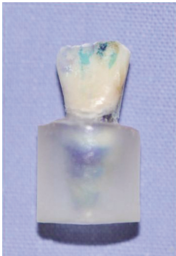
Figure 2. Tooth embedded in resin.

plugger (Dentsply Maillefer - Switzerland) # 8 and # 9. The samples in group C were subjected to preparation of the endodontic space for application of fiber post as far as the middle root with a Torpan bur, after complete removal of the Thermafil carrier, which was pulled out with tweezers. In this group no compaction of gutta-percha was carried out before using the Torpan bur.