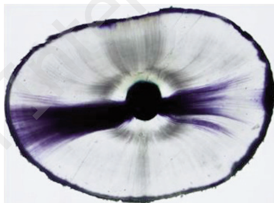
Figure 4. Sectioned sample with dentinal leakage 2.