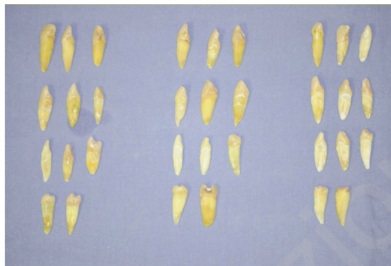
Figure 1. 33 extracted teeth.

This study involved 33 single-rooted extracted teeth, stored in saline solution and subsequently divided into three groups as follows: group A (control group): 4 up-