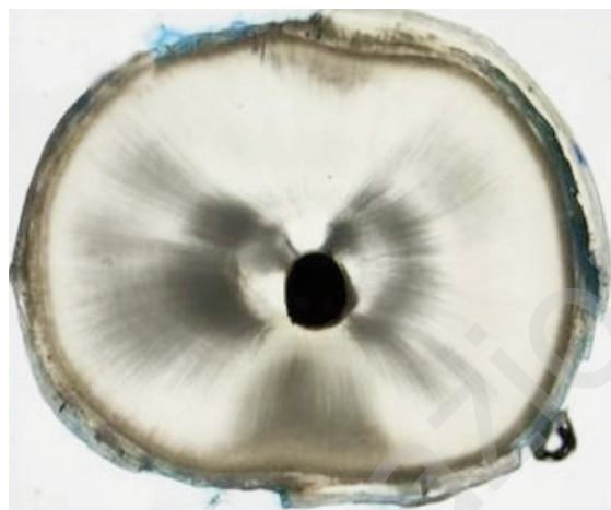
Figure 3. Sectioned sample without dentinal leakage.

Subsequently for each of the 33 teeth three sections were made using Micromet Automatica (Remet - Italy) cutting system at 1 mm (level "a"), 3 mm (level "b"), and 5 mm (level "c") from the apex, making a total of 99 thin sections. The sections thus obtained were then analyzed using an optical microscope and processed using Win CAD software, to calculate the area of dentin colored by methylene blue in relation to the total dentinal area. The aim was to evaluate the degree of infiltration of root fillings at three distances from the apex (Figs. 3, 4). Optical magnification also made it possible to assess the presence of voids in the endodontic material (Fig. 5). Findings were subjected to statistical analysis using Student T Test for p < 0.05 .