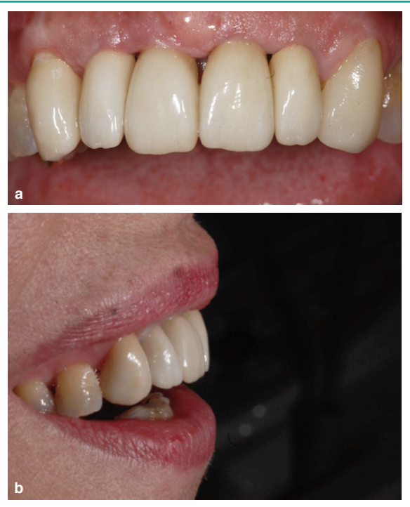
Figure 8 a, b Front and lateral view of the final aesthetic.

tion of the prosthetic rehabilitation (Figs. 7, 8 a, b). We delivered the finished prosthetic with no need of retouching as assess with the aid of maps of articulation. The modeling software used for the treatment of this clinical case have allowed to obtain a prosthesis extremely precise in the occlusal relationships with the opposing arch, the marginal fitting and in the reproduction of aesthetics simulated with virtual diagnostic wax-up.