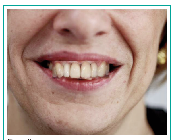
Figure 2 Virtual diagnostic wax-up.