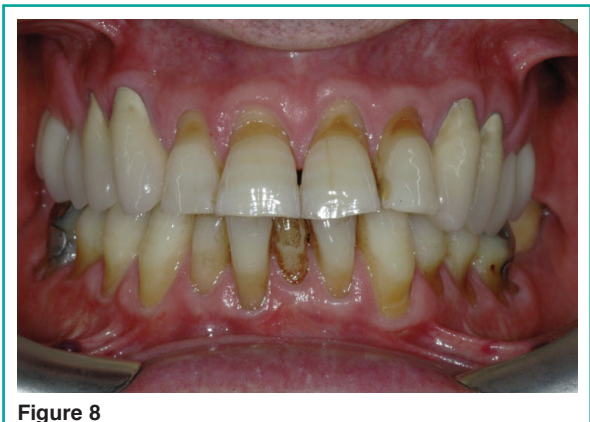
Frontal view of the final rehabilitation.

Detail of the PFM crowns and removable dental prosthesis with the own attachments performed by EDM technique: the latch of the removable prosthesis attachment will find location in the slot of the attachment of the PMF crowns.