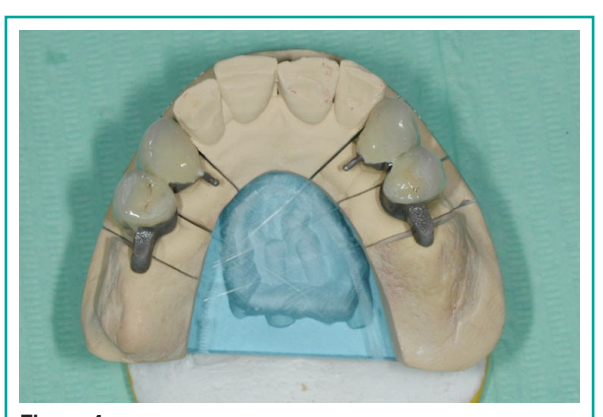
Figure 4 The master model and the PFM splinted crowns with the attachments performed by EDM technique.