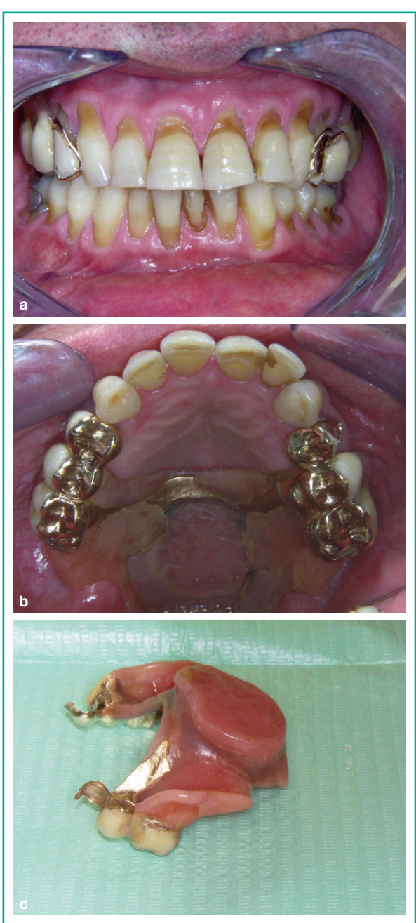
Figure 2 a, b, c Frontal view (a), occlusal view (b) of the removable dental prosthesis with conventional attachments and gold crowns/resin. The removable dental prosthesis (c).

The new rehabilitation treatment of this oralnasal communication was a mixed prosthetic rehabilitation (fixed and removable), a removable