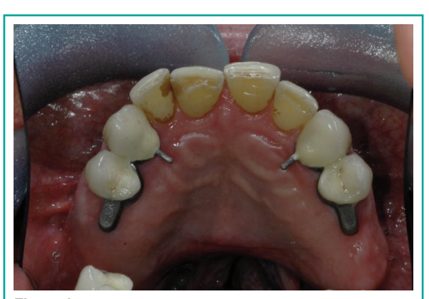
Figure 3 The intraoral test of the PFM splinted crowns with the attachments performed by EDM technique.

Figure 7 shows a detail of the PFM crowns and removable dental prosthesis with the own attachments performed by EDM technique: the latch of the removable prosthesis attachment will find location in the slot of the attachment of the PMF crowns, to retain and give stability to the removable dental prosthesis with obturator.