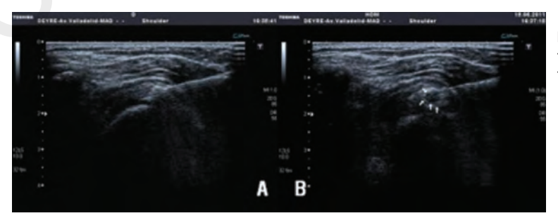
Figure 1 A-B. (A) Needle point entering below the calcification. (B) The introduction of liquid produces a cavity through the pumping effect enabling the lavage.

First the needle is inserted with the syringe containing mepivacaine and the ultrasound probe is placed on the path to be followed. We always start the procedure with the 20G needle. The anaesthesia is then administered to the area from the point of entry on the skin into the subacromial bursa. The needle is placed below the calcification and the needling and lavage commences with the rest of the anaesthetic through the actual pressure placed on the embolus of the syringe from the outside with a pulsating or pumping mechanism (Fig.1). These impulses continue until the calcic material is extracted. When the syringe is full of calcium deposits, the syringe is changed for another containing a physiological saline solution, without removing the needle from its position. The pumping, pressure and lavage continues, successively changing the syringes until no further calcium deposits are extracted or until the patient shows signs of discomfort. Once the lavage is completed, the syringe containing the physiological saline solution is changed for the one containing Triamcinolone. The needle is gradually extracted until the bursa, where 2