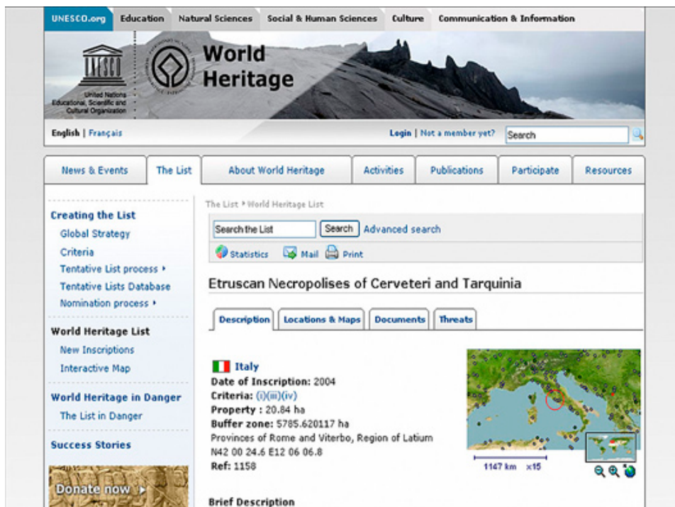
Fig. 1 – UNESCO World Heritage List.

publish data coming from the excavations in the central area of the urban plateau, where several archaeological phases, from the Villanovan period to the Roman one, have been brought to light. Following modern trends of contextual archaeology, a comprehensive knowledge of ancient city planning development over the centuries was achieved.