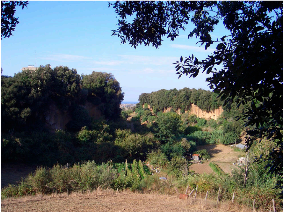
Fig. 2 – A typical Caeretan landscape.

world – of the Temple of Vigna Parrocchiale, dating back to the beginning of the 5 th century BC, in respect to the tumuli of the Banditaccia necropolis.