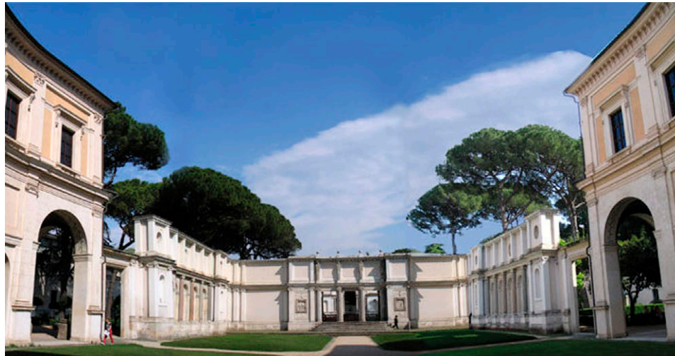
Fig. 8 – Villa Giulia Etruscan National Museum: the courtyard.

In our project, in fact, virtual musealisation is not intended as a virtual exhibition but as an instrument of re-contextualisation of finds that for different reasons, including the illegal excavation market, are housed in various museums