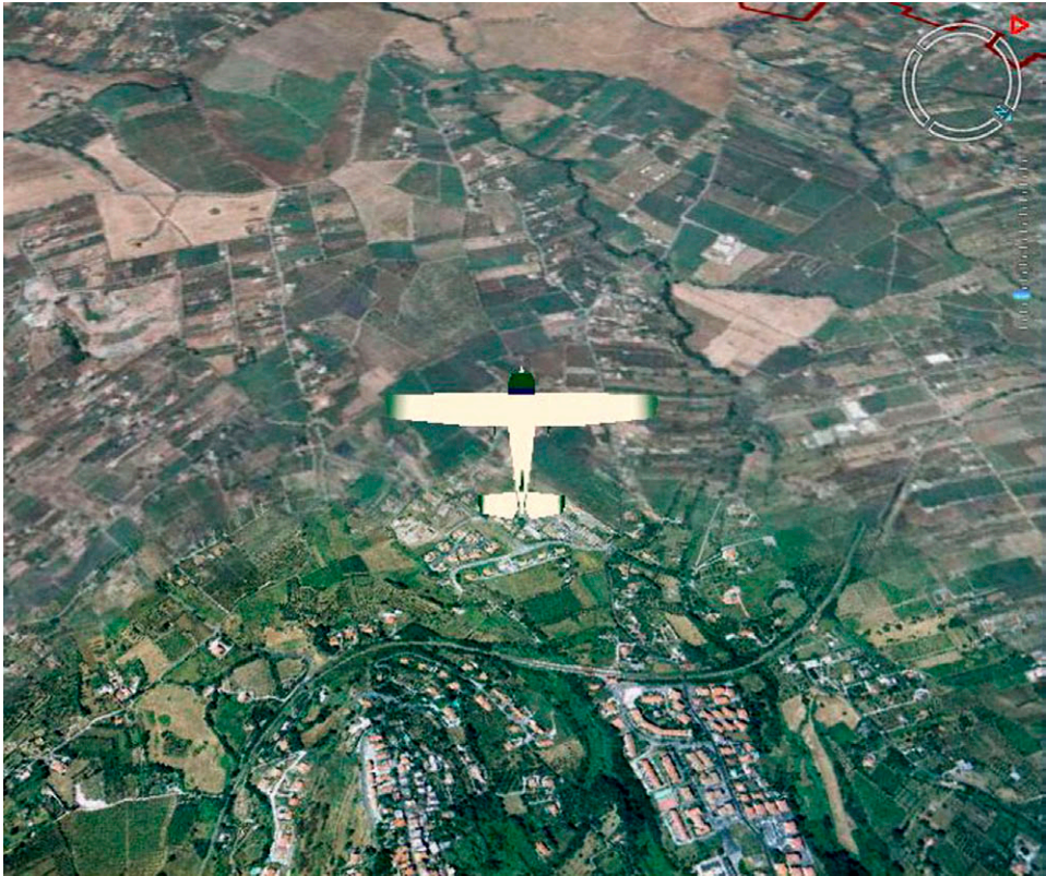
Fig. 6 – An example of the “flight” methodology during the itinerary.

During the flight, through general and detailed views, some intermediate steps are programmed: the ancient route of the Via Aurelia (Fig. 7), Pyrgi (the port of Caere and place of a famous Etruscan sanctuary), the Archaeological Museum of Cerveteri and finally the plateaus occupied by the necropolises and the ancient town. The narration develops around archaeological records, intended as evidence connected to the territory but enriched with historical and cultural information.