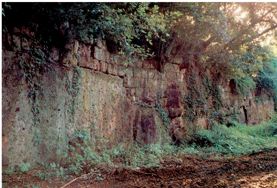
Fig. 10 – Caere: part of the original tufa walls.