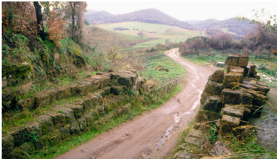
Fig. 9 – Caere: the “Porta Coperta” gate.