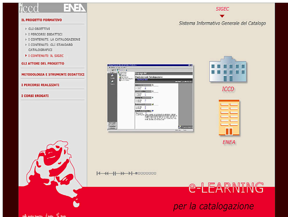
Fig. 3 – SIGEC e-learning website.

cartographic form, and in particular in the set up of thematic Atlases. We can quote for example the “Atlas of historical places” 4 , which has been planned as a container of geographic, administrative and safeguarding information together with statistical data coming from the census of historical centres. We can also mention the FastiOnline project 5 , created by the International Association for Classical Archaeology: a web-based GIS database proposing an in-depth coverage of current archaeological excavations, begun in Italy and now expanding to other countries. However, it is particularly worth noting the twenty-year evolution of digital cartography as applied by the Chair of Ancient Topography at the University of Rome “La Sapienza” 6 in national and international projects (Fig. 4), such as the Tabula Imperii Romani (SOMMELLA 2006).