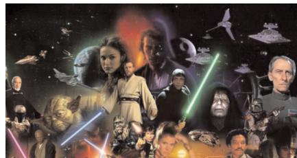
The Star War saga: a famous film series created by George Lucas.