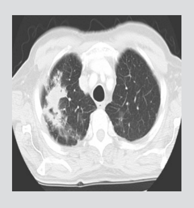
Figure 1: CT of the chest showing nocardial focus.

During admission the patient became febrile with a temperature of 39.7°C. Laboratory investigations revealed an elevated white cell count of 23.30 with neutrophilia 20.90 and a C-reactive protein of 100. Blood cultures, sputum cultures and cerebrospinal fluid (CSF) cultures from a lumbar puncture were all negative. Blood and sputum cultures for acid-fast bacilli were also negative. MRI of the brain to further characterize the cerebral lesion showed a 1.1×1.1 cm ( Fig. 2 ) peripherally enhancing subependymal mass adjacent to the body of the left ventricle. It had a peripheral low signal rim with central restricted diffusion on T2 images. The surrounding vasogenic oedema was out of keeping with the size of the lesion. A transthoracic echocardiogram was unremarkable.