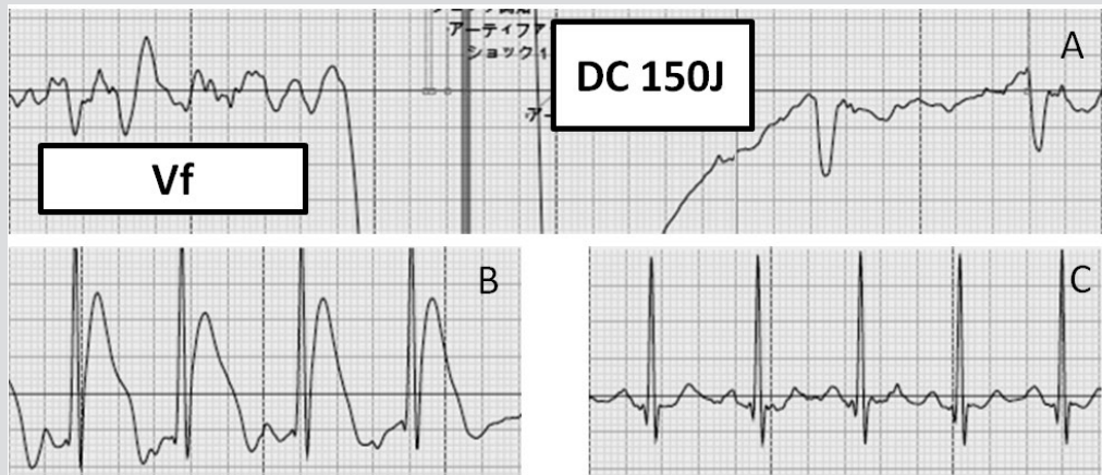
Figure 1: The electrocardiogram record of the automated external defibrillator

after successful cardioversion showed ST-segment elevation (Fig. 1B), which disappeared promptly (Fig. 1C). After the return of spontaneous circulation, the patient was brought to the emergency department of our hospital.