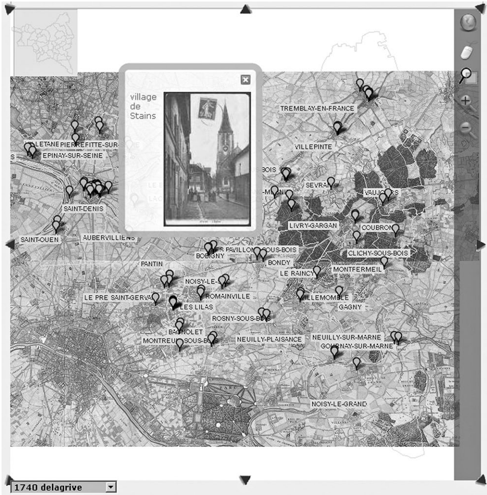
Fig. 7 – Repertory of the sites and buildings, detail of the display interface of the results of a request in a cartographic form, with display on a map background of an ancient document (Département de la Seine-Saint-Denis).

Ile-de-France. It inventories all the significant elements of soil occupancy prior to the beginning of the 19 th century, whether they are known through archaeological works or historical sources: archaeological sites in the strict sense of the term, settlements (villages, hamlets, isolated farms), artisanal structures (mills, quarries, etc.), seigneurial residencies (castles, manors, fortified houses), delimitation or boundary marking elements (boundary posts,