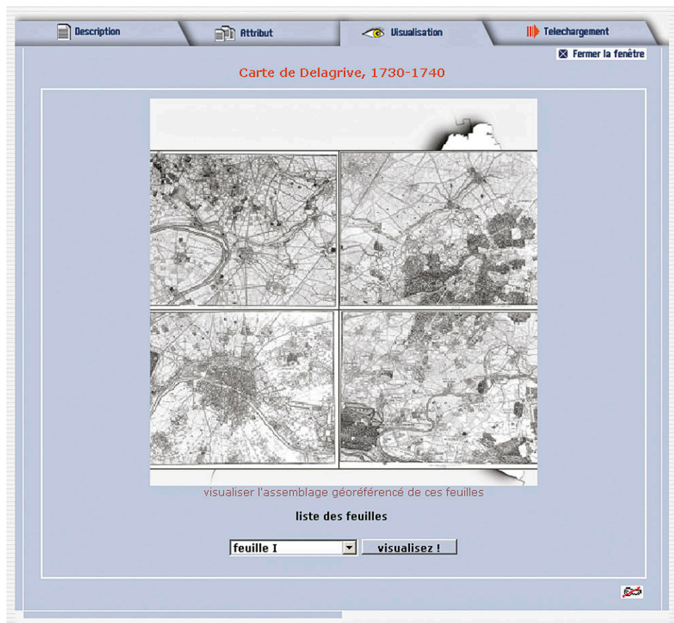
Fig. 2 – Geographic catalogue, visualization interface of the raster maps (Département de la Seine-Saint-Denis).

based on a classification of the entities with an attribute set prior to the creation of the SVG: the archaeological sites are therefore distributed in several backgrounds, according to chronological periods.