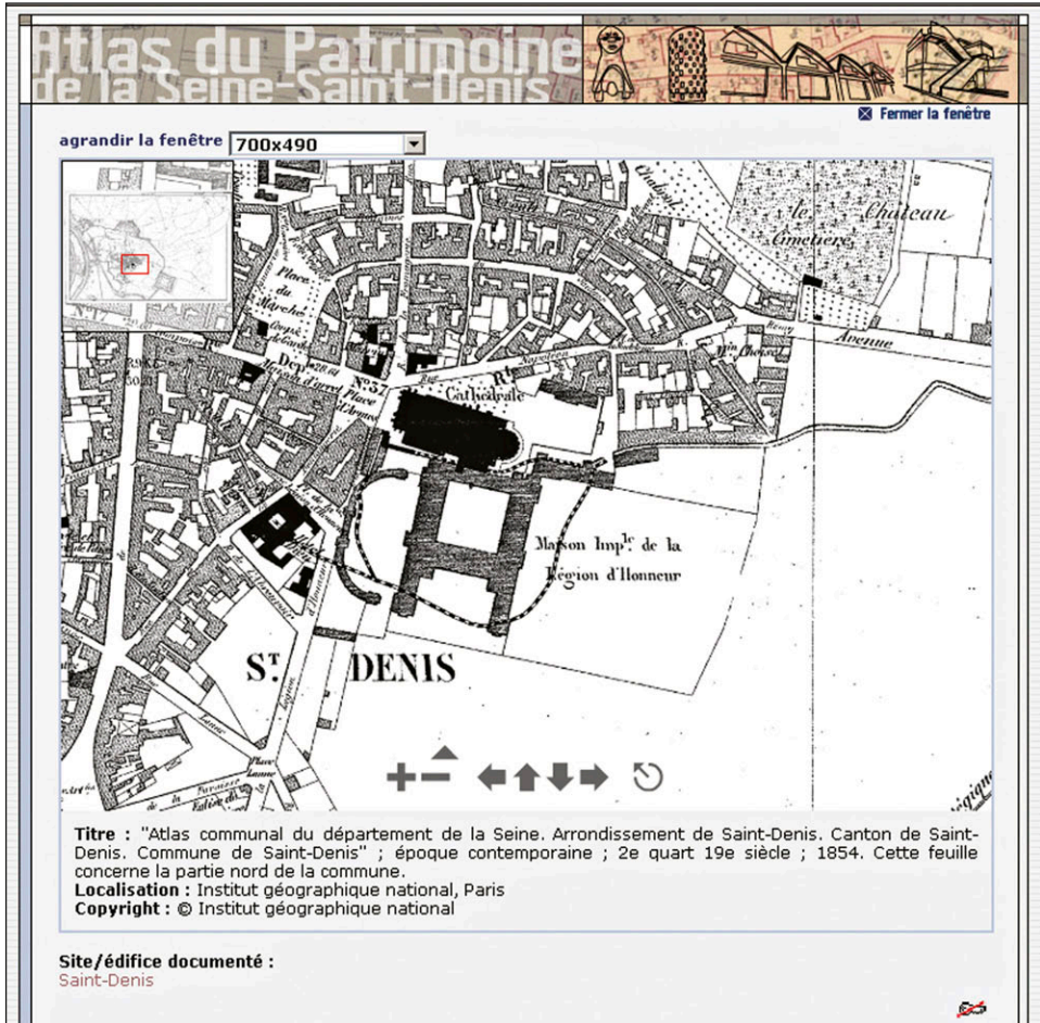
Fig. 3 – Geographic catalogue, visualization interface of the raster maps (Département de la Seine-Saint-Denis).

A special mention must be made about one of its layers of information, whose structure was the subject of a major work of graphical acquisition between 2002 and 2008. This is the Napoleonic cadastre, whose 448 section plans, dated from 1808 to 1839, have all been vectorized from their scans that were undertaken by the Departmental Archives Service of Seine-Saint-Denis.