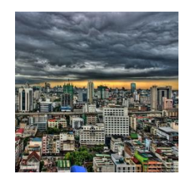
In this number IDEAS AND APPROACHES TO FACE CLIMATE CHANGE IN CITIES