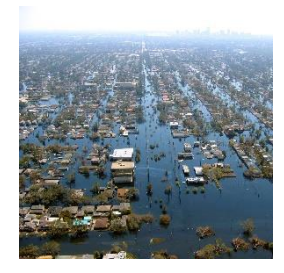
In this number THE URBAN ADAPTATION TO CHANGES