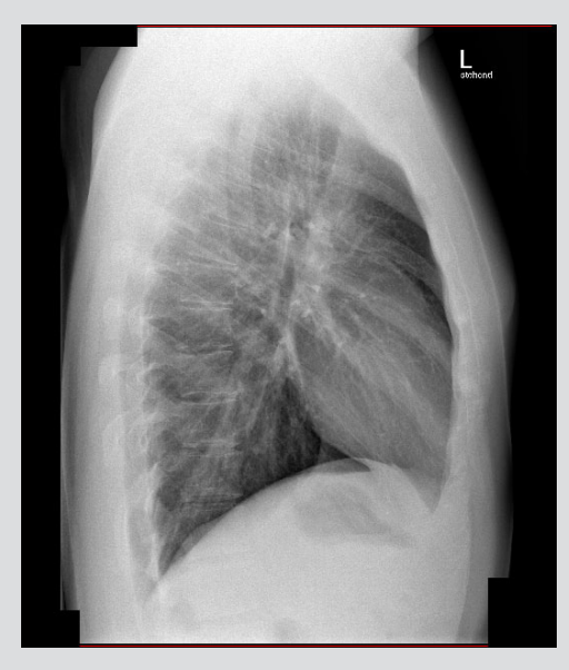
Figure 4. Lateral chest radiograph on arrival at the emergency department

Table 3. Relevant haematology, biochemistry and urinalysis results (abnormal results in bold).