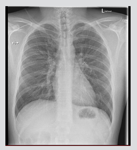
Figure 3. PA chest radiograph on arrival at the emergency department

Table 2. Arterial blood gas analysis at 673 m (abnormal results in bold).