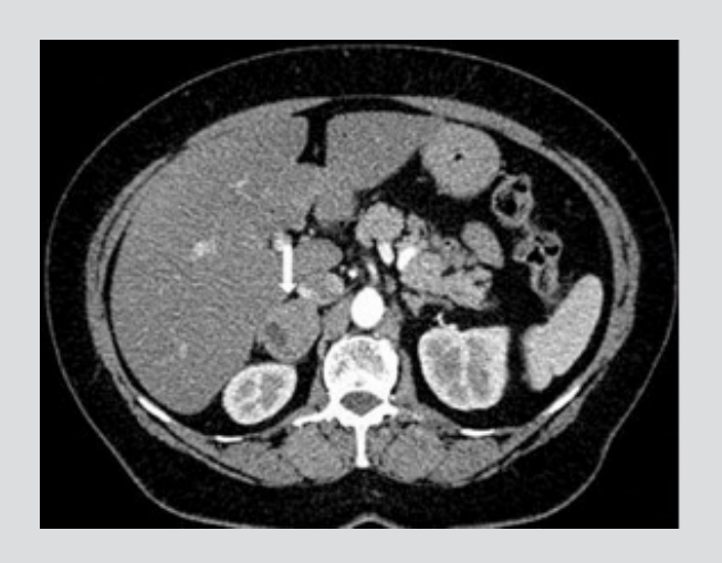
Figure 1. Computed tomography of the abdomen showing an incidental finding of a right adrenal mass (diameter 28 mm)

On physical examination, the patient's heart rate was 61 bpm and her blood pressure (BP) was 150/90 mmHg without postural drop, her BMI was 30.7 kg/m², and she had a waist circumference of 107 cm. No signs of hypercortisolism, such as buffalo hump, moon face, striae or skin abnormalities, were seen. Ambulatory blood pressure monitoring (ABPM) revealed a global mean BP of 135/85 mmHg without a drop in nocturnal BP (non-dipping profile). The EKG was unremarkable. Routine blood tests were normal. Hormonal evaluation was performed after adequate preparation ( Table 1 ). In particular, urinary free cortisol (UFC) and plasma cortisol (PC) following an overnight dexamethasone test were high and associated with a low plasma ACTH value. A diagnosis of subclinical hypercortisolism (SH) was made, and considering the increasing diameter of the adrenal mass, the patient underwent a laparoscopic adrenalectomy. Intraoperatively, the patient did not experience any haemodynamic alterations. The post-operative course was uneventful, and the patient was discharged from hospital on a cortisol substitute and attended regular follow-up appointments.