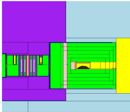
Fig. 2. – (Colour on-line) Section of the irradiation facility obtained in the Thermal Column of the TRIGA reactor, University of Pavia. It is visible the liver placed in the irradiation position inside the channel and the two bismuth screens, protecting it from the \gamma radiation coming from the core (pink walls between the reactor core and the liver). The reactor was fully simulated by MCNP.

dissemination of the metastases in the whole liver. Then he died for a general recurrency of the tumor in different organs. The second patient, although BNCT succeeded in destroying the metastases, died in 33rd post operative day for a cardiac failure. Obviously two treatments do not allow to draw conclusions as in a complete clinical trial, nevertheless the CT scan of the livers without tumor nodules just after the organ irradiation is a clear demonstration of the BNCT effectiveness in treating tumors that, nowadays, have no other treatment options.