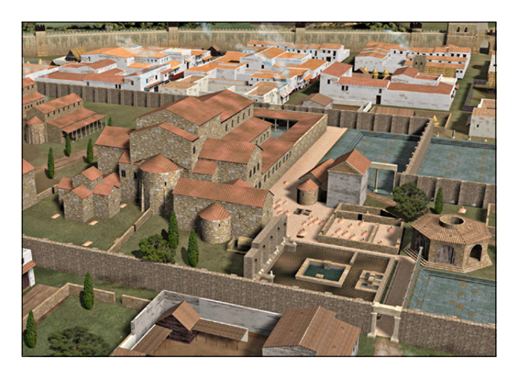
Fig. 2 – Episcopal Complex reconstruction, 2003 version.

the apse by a double line of carved limestone fences, sustained with bars. It has been identified as the Mausoleum dedicated to St. Vincent. Bishop Justinian would probably have moved the martyr's body from his original grave on the outskirts in La Roqueta to the apse. The tomb inside the Mausoleum, located in the center, should belong to the bishop himself. Therefore, this funeral building became an important center of pilgrimage around the figures of a highly revered martyr and a bishop considered a saint.