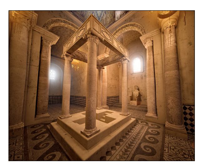
Fig. 3 – Reconstruction of inner Baptistery, 2014 version. Archive of SIAM (Secció d'Investigació Arqueològica Municipal, València).

Late Antiquity cities. New and actualized versions with new archaeological remains and the applications of technological advances were made in 2003 and 2007 (Fig. 2).