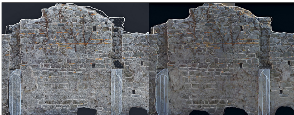
Fig. 2 – Pointcloud and orthophoto exported to AutoCAD of the northern chapel wall, Bishop Episcopal Palace, Side, Turkey.

would provide in case of needs of a wider coordinate system that can be used to include the survey data into a regional, national or international dataset.