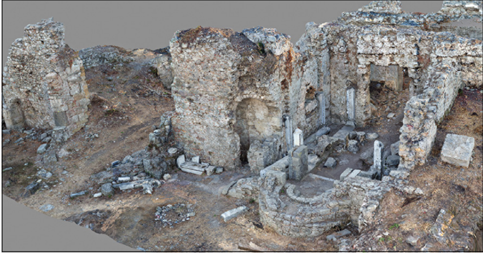
Fig. 4 – Chapel on the main compound of the Episcopal Palace, Side, Turkey (.ply model on Photoscan).

heights and the geoid model. A geoid model is the closest and stable surface running under the land matching the mean of the ocean surface (YILMAN, KARALI 2010, 1829). It is an idealized equilibrium surface of sea water (TORGE 1980, 76-114). The geoid surface is more irregular than the ellipsoid of revolution often used to approximate the shape of the physical Earth, but considerably smoother than Earth's physical surface (SANLIOĞLU, MARAS, UYSAL 2009, 2). It can differ globally 110 m. Therefore, the geoid model related to your geographical area is necessary to have the most accurate orthometric height.