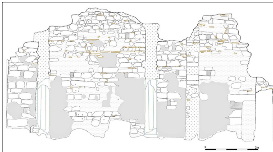
Fig. 3 – Northern chapel wall, Bishop Episcopal Palace, Side, Turkey.