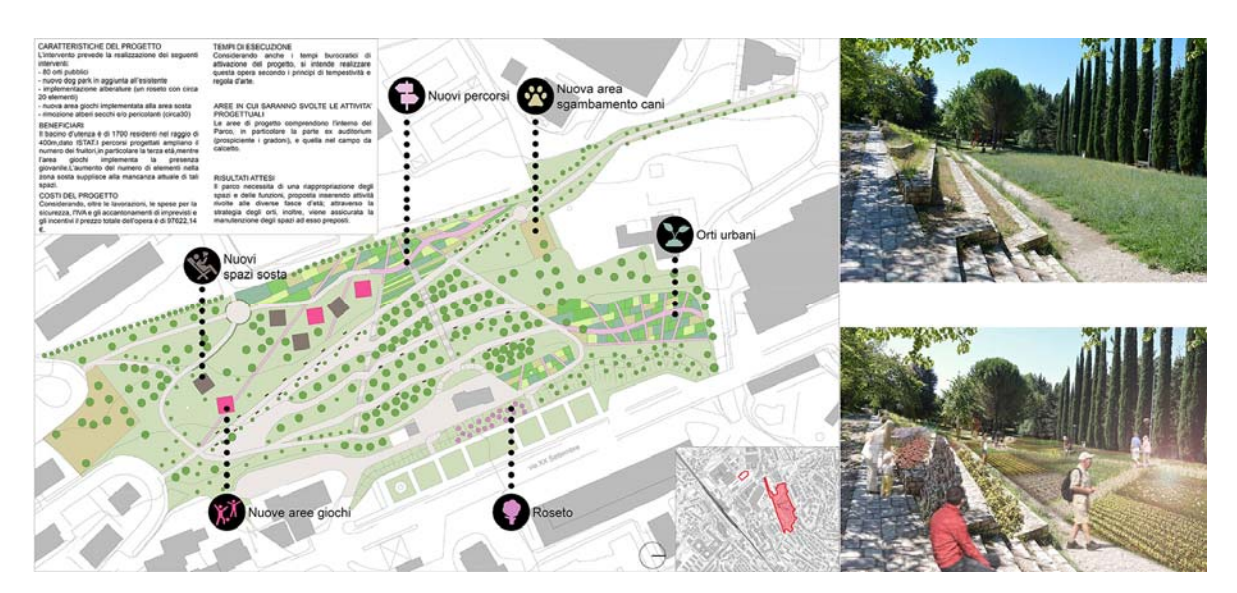
Fig. 5 Masterplan and view of "Parco della Pescaia"