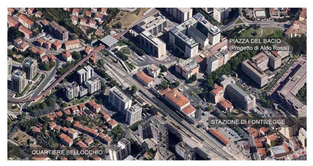
Fig. 1 View of the area project of Fontivegge Ditrict in Perugia

Paths will be enriched with naturalness chromatism to create a fundamental "edible landscape" and strengthen connective value of the ecological redesign. In this regard, the project encourages spontaneous naturalization processes, redefining relationships between vegetation and local communities. The pedestrian network now becomes functional to the green infrastructure system and the polarity of the parks, which at the same time are organically functional to the system for pedestrian and bicycle paths that unfold inside them.