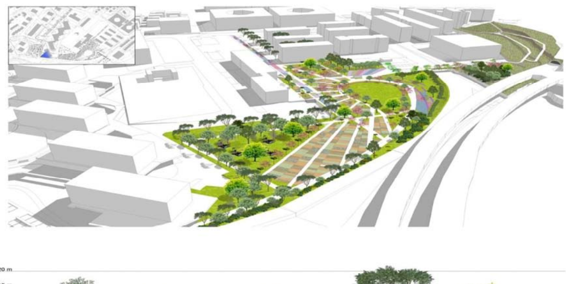
20 m 15 m 10 m Captura Frassino Bagolaro Acero Sorbo Prunus Olmo Morus Melo