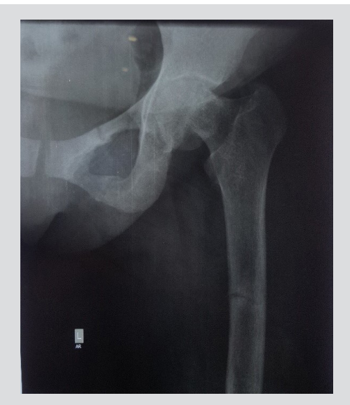
Figure 1. X-ray of the left femur and pelvis, February 2012

X-rays revealed a fracture of superior ramus of the left pubic bone and proximal parts of the right and left femurs (Figs. 1 and 2). She was conservatively managed for her fractures and her weakness improved with potassium replacement.