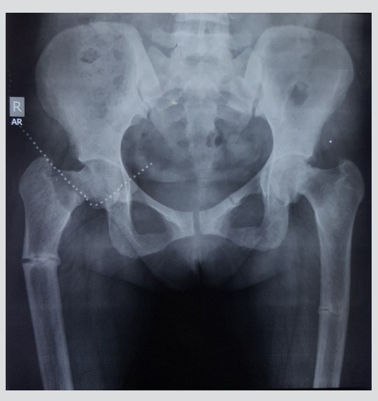
Figure 2. X-ray of the left femur and pelvis, September 2012