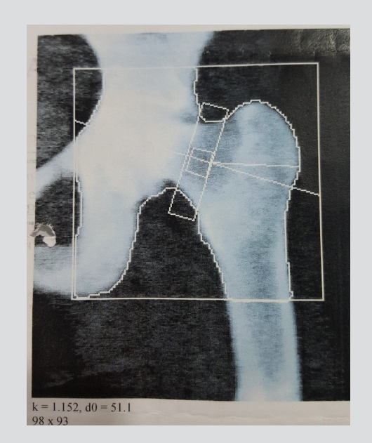
Figure 5. DXA scan, March 2016