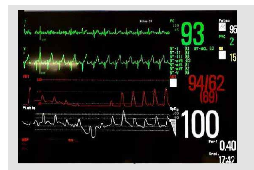
Figure 1. Invasive blood pressure monitoring through the pedidial left artery, avoiding jerk-related artefacts during cough, demonstrated a significant drop in blood pressure without changes in heart rate during the syncope attack (baseline arterial pressure 125/80 mmHg; immediate post-cough arterial pressure 60/30 mmHg)

During hospitalization and therapy with enoxaparin, the patient developed haemorrhagic shock due to right shoulder post-traumatic haematoma (haemoglobin fell from 16 to 7 g/dl) with episodes of supraventricular tachycardia. He was transferred to the cardiovascular intensive care unit where he was treated with fluids and administration of blood components resulting in haemodynamic and rhythm stabilization. Over the next few days he presented several new syncopal attacks. During these episodes, invasive pedidial blood pressure monitoring demonstrated a significant drop in blood pressure without changes in heart rate ( Fig. 1). To investigate whether syncope was related to an abnormal vagal reflex, atropine 1 mg i.v. was administered as vagolytic treatment, resulting in temporary control of syncopal episodes. Another otolaryngologist assessment with laryngoscopy revealed hypomobility of the left vocal cord. In order to determine if vagal nerve dysfunction was present, laryngeal electromyography was performed and revealed signs of acute neurogenic damage of the cricothyroid and thyroarytenoid left muscles with denervation potentials ( Fig. 2).