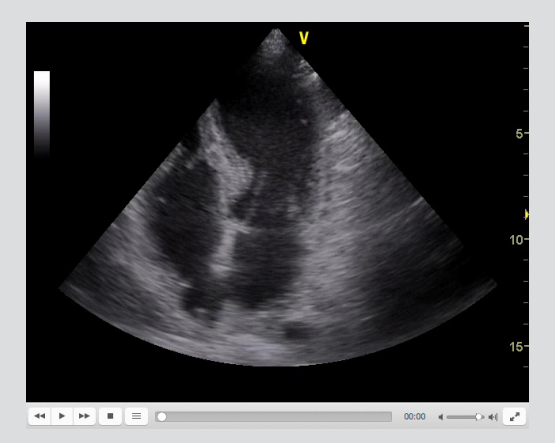
Video 1. First echocardiogram: severe hypokinesis in the apical segments and hyperdynamic basal segments, with an ejection fraction of 25%. Click here to view the video: https://youtu.be/F9w-AYn5IQI