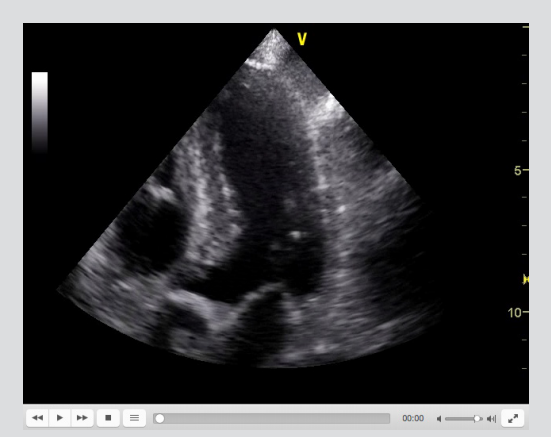
Video 2. Second echocardiogram: normalization of cardiac wall motion and an ejection fraction of 70%. Click here to view the video: https://youtu.be/Z5VgOfU2GMg

Alternatively, this case might be interpreted as an acute pancreatitis with septic shock and multiple organ failure, including adrenal insufficiency. Nevertheless, this scenario would not explain the severe apical hypokinesis with hyperdynamic basal segments, as well as its normalization within a few days. The rapid recovery of the multiple organ failure, normalization of the elevated lipase (in 48 hours) and tapering off of the norepinephrine infusion (immediately after corticosteroid administration) also do not favor the diagnosis of acute pancreatitis with septic shock and multiple organ failure.