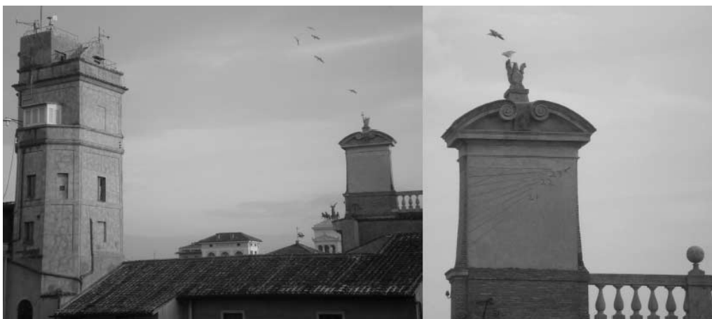
Fig. 5. – The horologium of Clavius at Collegio Romano. It works with Italic hours, i.e. sunset corresponds to the 24th hour.

To him is dedicated a crater on the Moon, in the Selenography made by Giovanni Battista Riccioli and Francesco Grimaldi in the Almagestum Novum of 1655. The crater is the bigger in the lunar sector dedicated to Ptolemaic astronomers, and Clavius was indeed the greatest among them.