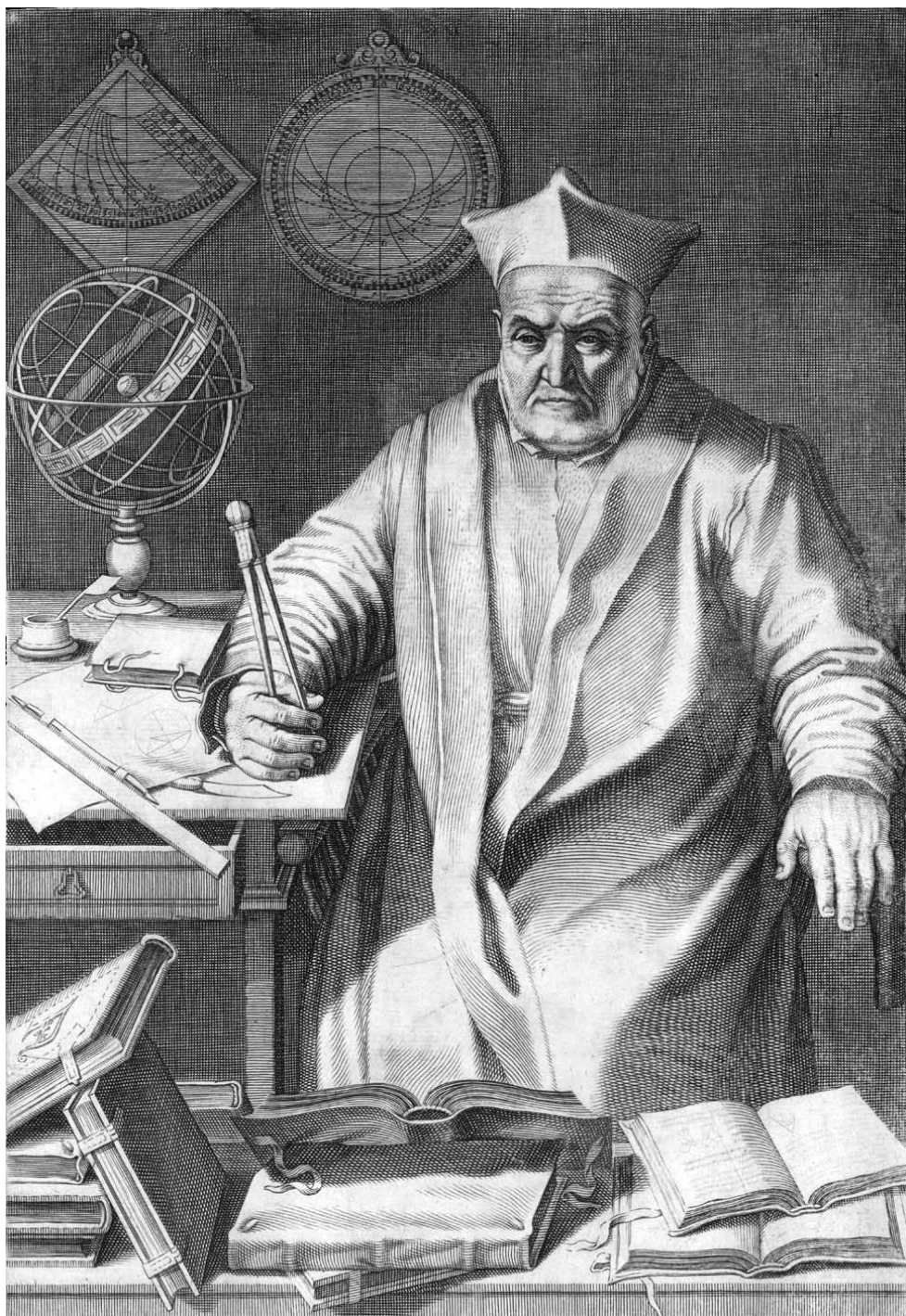
Fig. 1. – Christopher Clavius (1538-1612) born in Bamberg (Germany), studied in Coimbra (Portugal) and taught Mathematics, Geometry, Astronomy and Cartography in the Collegio Romano, in Rome (Italy) all his life.