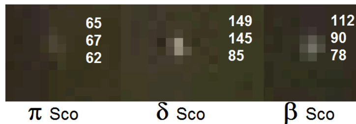
Fig. 3. – The stars with their brightest 3 pixels, used for the estimation of the magnitude. Here is the image of July 12, 2011, with delta very close to the full Moon. The intensity of each star is proportional to the sum \Sigma of the three brightest pixels in the G channel. The relative error of such hypothesis of proportionality to the sum \Sigma , due to Poisson's statistics, is 1/\sqrt{\Sigma} . This channel is the closest to Johnson's V band [7]. The luminosity of delta Scorpii with respect to its reference stars \beta and \pi is M_{v\beta, \pi} - 2.5 \log(\Sigma\delta/\Sigma\beta, \pi) . The value published in the AAVSO website is the average (M_{v\beta} + M_{v\pi})/2 and the errorbar adopted is the semi-difference between M_{v\beta} and M_{v\pi} .

Alpha Orionis and Alpha Scorpii itself, are very interesting targets of similar observational campaigns, as well as other bright stars. Being the brightest stars in their surroundings the calibration of the detectors is crucial for the success of these studies.