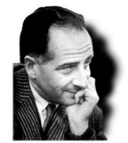
15 руно Понтекора ... always smiling ...

In his Note Autobiografiche (1988-1989) [33] Pontecorvo wrote: