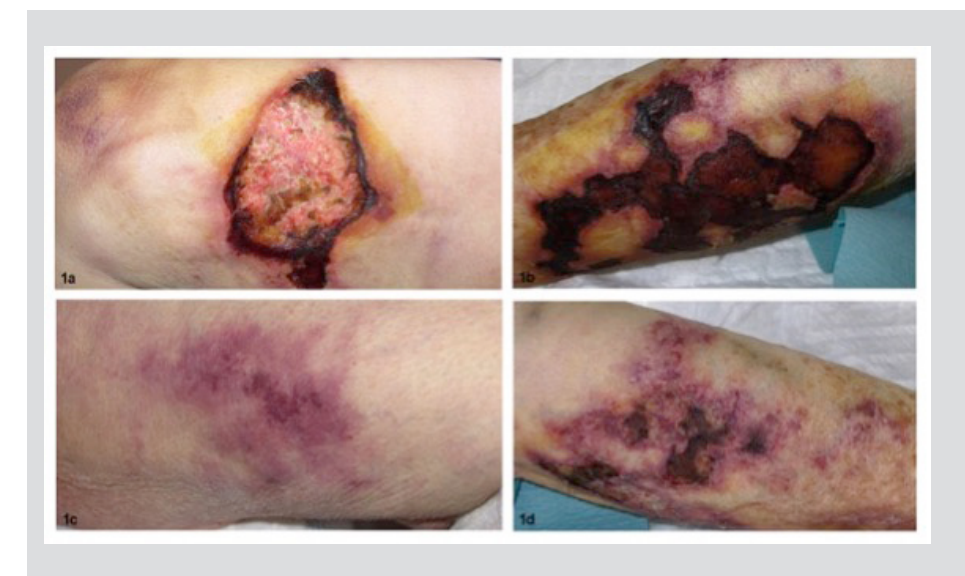
Figure 1. Painful stellate necrotic ulcers with mottled to reticular purpura of surrounding skin on both legs and the right thigh (a, b, d); reticular violaceous stellate non-ulcerated plaque on the left thigh (c)

In light of the diagnosis of calciphylaxis, wound care was maintained with regular debridement, appropriate dressings and infection control, along with opioids for analgesia. A single session of HOT was performed, with poor patient tolerability. Treatment with STS was considered, but the patient died from septic shock 12 weeks after admission.