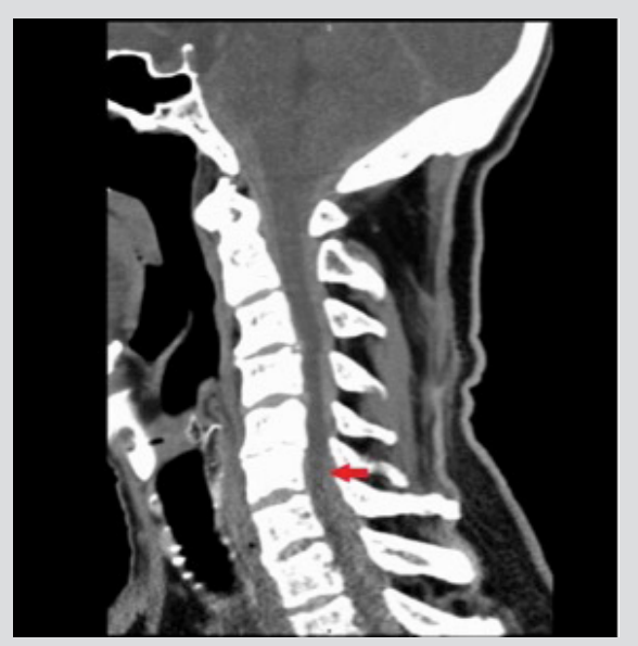
Figure 1. CT medullary scan showing a posterior medullar haematoma at the C5–T2 level (red arrow)