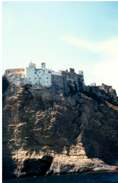
Figure 11. Detail of the Terra Murata coastal cliff whose outcrop shows the stratigraphy of the pyroclastic successions and a deep cave incised in tuffs.

Figure 10. Detail of the Terra Murata coastal cliff, showing the stratigraphy of the pyroclastic successions having different technical characteristics.