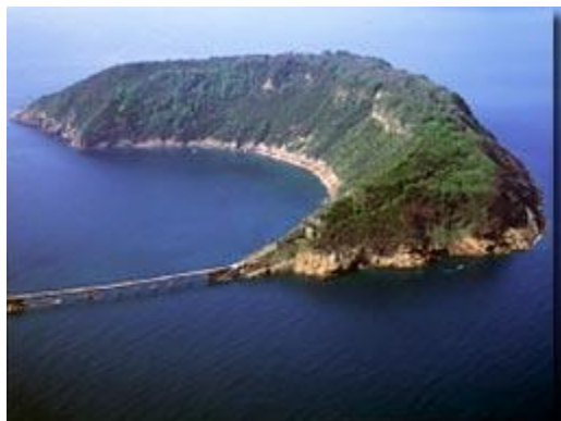
Figure 5. The Vivara volcano.

The Vivara volcano includes the Vivara inlet and the S. Margherita promontory. It is represented by a ring of yellow and grey tuffs, well stratified, having a circular shape (Figure 5). The lower part of the Vivara tuffs is formed by massive metric banks of yellow tuffs, constituted by a yellow cineritic matrix, completely lithified and by shardy dark grey lapilli having a trachybasaltic composition. They grade upwards to grey stratified tuffs, slightly lithified. The transition among the two units crops out at Punta Capitello and in the coastal cliff between Punta Mezzogiorno and Punta Alaca, while the culmination of the crateric rim may be seen northwards of Punta Mezzogiorno and S. Margherita vecchia.