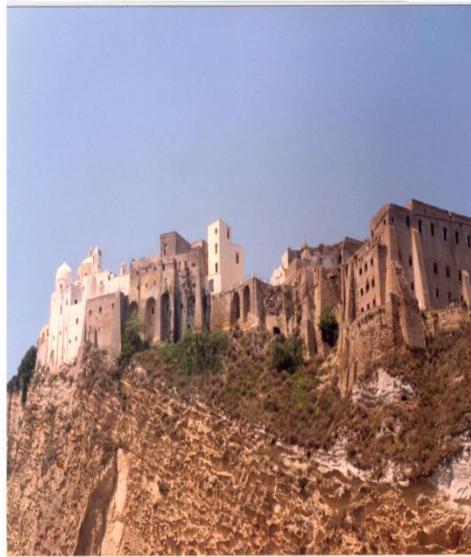
Figure 12. The upper part of the Terra Murata coastal cliff, showing the superimposition of the grey facies (to the top) on the yellow facies (to the base).

The first facies, yellow in colour, is completely lithified. The second facies, grey in colour, is semi-coherent. The two facies are not separated by an abrupt lithostratigraphic boundary. In fact, the lithified yellow facies grades upwards or laterally in the semi-coherent grey facies. This is probably due to the mechanisms controlling the individuation of the two facies, such as the processes of post-depositional zeolitization, realized after an incipient hydrothermal activity and involving the most part of the tuffaceous products of the Island of Procida.