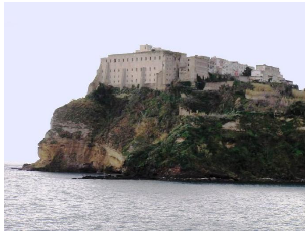
Figure 1. View of the Middle Ice village of Terra Murata (Island of Procida), overlying a tuff coastal cliff facing on the Tyrrhenian sea (Naples Bay).

In this paper a geomorphologic study of instability processes in two selected areas of the Island of Procida, located in the Naples Bay (southern Tyrrhenian sea) has been carried out. These areas are respectively located in the historical center of Procida (Middle Ages village of Terra Murata; Figure 1) and in correspondence of the coastal cliff joining the Pizzaco and Solchiaro promontories, herein named the Centane-Panoramica geosite.