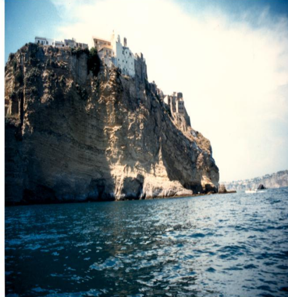
Figure 10. Detail of the Terra Murata coastal cliff, showing the stratigraphy of the pyroclastic successions having different technical characteristics.

Figure 9. The Terra Murata coastal cliff towards the Corricella Bay, where the superimposition of two facies with different lithotechnical characteristics may be seen.