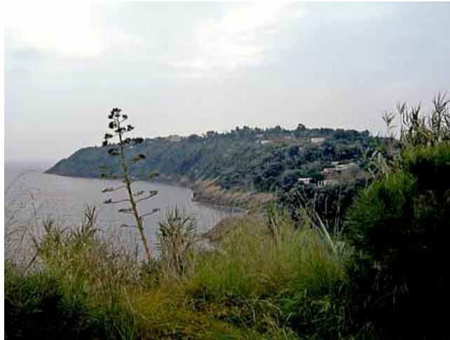
Figure 8: The Solchiaro promontory (Island of Procida, Naples Bay).