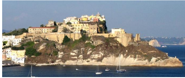
Figure 2. The tuff coastal cliff of Terra Murata towards the Corricella Bay (Island of Procida, Naples Bay).

In this paper a geologic framework of the Terra Murata quarter will be delineated, referring to the stratigraphic relationships between the volcanoclastic rocks and deposits and to the hydrogeologic factors, which have probably controlled the seepages of waters. Some possible technical solutions will be individuated to study and to solve this problem, which was probably also controlled by the occurrence in the subsurface of ancient Borbonic sewers/old tanks/cavities.