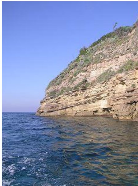
Figure 7. The Pizzaco promontory (Island of Procida, Naples Bay).

The deposits forming this unit are genetically related to the eruptive activity of the Solchiaro tuff ring, representing the youngest eruptive activity of the Island of Procida. The crateric rim has been identified in the south-eastern sector of the Island of Procida, between the Pizzaco promontory (Figure 7) and the Solchiaro promontory (Fig. 8). The deposits of the Solchiaro volcano widely occur in the upper part of the stratigraphic sequences cropping out in many coastal cliffs of the Island of Procida. They crop out also at Vivara, to the north of Punta Mezzogiorno and around Punta Capitello. Next to the volcanic vent, outcropping along the coastal street bounding the Pizzaco and the Solchiaro promontories (Panoramica street), a transition from stratified yellow tuffs to stratified grey tuffs has been observed, suggesting a deposition in a mostly subaerial environment.