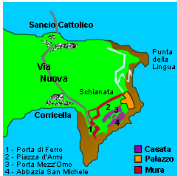
Figure 3. Sketch representation of the structures of the Middle Age village of Terra Murata

The Centane-Panoramica geosite, characterized by the coastal street joining the promontories of Pizzaco and Solchiaro, where the Solchiaro yellow tuffs widely outcrop, offers many examples of geomorphologic instability. They have been observed in outcrops of the coastal cliffs facing seawards towards the Tyrrhenian sea. Since the '60 th these sectors have been used as the dumps of undifferentiated deposits. The present-day flat morphology of some areas may deceive on their condition of stability, which may result precarious, if these areas should be submitted to loads not proportional to the geotechnical parameters of stability of the undifferentiated Quaternary deposits or in conditions of water flooding, also considering the lacking of a drainage system of meteoric waters.