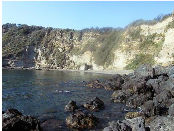
Figure 6. The tuff coastal cliff between the Corricella Bay and the Pozzo Vecchio beach (“Spiaggia del Postino”).

forming a ring-shaped volcano, whose crateric rim is well visible in the bay between Punta Serra and Punta Ottimo (Figure 6). The edifice of the Pozzo Vecchio volcano is composed of thinly stratified tuffs, grading upwards into fall deposits having a coarser grain-size, poorly sorted, with intercalations of thin cineritic levels. A scoria cone, formed by banks having a reddish colour, is superimposed on the northern flank of the volcanic edifice. The scoria deposits are overlain by a lava flow having an alkali-trachytic composition.