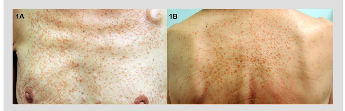
Figure 1. Multiple skin-coloured to brown papules on (A) the upper chest and (B) the upper back

In the past 2 years, stage IV breast cancer with multifocal metastatic bone disease had been documented. Letrozole therapy was given initially, with partial response, but during the previous year there had been continuing on-going symptomatic bone involvement. The patient had declined further medical treatment and initiated alternative therapies, namely ozonotherapy. On physical examination, multiple skin-coloured to brown papules were seen on the neck, trunk, arms and thighs ( Fig. 1 ). A punch biopsy was performed and confirmed the diagnosis of cutaneous infiltration by neoplastic cells, compatible with metastatic lobular carcinoma of the breast ( Fig. 2 ).