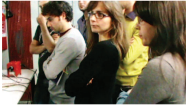
Fig. 3. – A sample picture taken during the traditional structured inquiry.

show a picture taken during the phase of structured inquiry without activation, where many arm-cross events are observed. Usually this kind of posture is a self-comforting posture used mostly unconsciously to alleviate nervous tension and isolate ourselves. In special situations this position might also suggest self-importance or disagreement. Moreover, some students remain focused on the experimental setup, looking at the data appearing on the oscilloscope screen, while others look away, probably lowering the attention towards the experimental results (fig. 3).