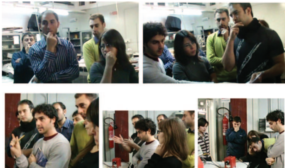
Fig. 4. – Pictures taken during the phase of Elicited Inquiry.

The stimulating discussions between students and instructors about the experimental findings coming from the Frank-Hertz experiment produced a specific effect of activation of the inquiry process. In fact, the students showed many more postures associated to