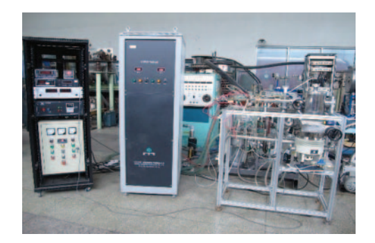
Fig. 2. – Physical device of plasma window.

We used FLUENT software to set appropriate boundary conditions and quadrilateral mesh to simulate our real plasma window design. In order to analyze effects of shape of plasma window on the its flows characteristics, different shapes of plasma section wall has been designed to see whether there exists an optimized point where we can realize the satisfactory plasma isolation function with lower argon gas waste. Table I shows simulated results of 3 mm plasma window with different shapes of plasma section