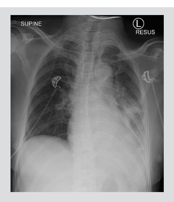
Figure 1. Patchy air-space opacities in the left mid and lower zones on chest radiograph Figure 2. Scattered foci of restriction diffusion (white arrows) in bilateral cortical, subcortical and deep white matter regions on magnetic resonance imaging of the brain