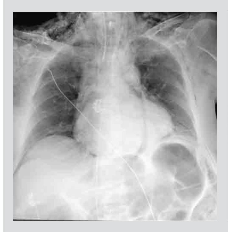
Figure 1. Chest radiograph showing a significant pneumomediastinum with subcutaneous emphysema in the cervical and axillary regions. A left pleural effusion is also seen

These results were consistent with Boerhaave syndrome ( Figs. 1–3 ). Broad-spectrum intravenous antibiotic therapy with meropenem was initiated. However, surgical treatment was not undertaken in light of the patient's comorbidities and general condition. Endoscopic treatment was proposed but refused by the family. Supportive treatment was started and the patient died 48 hours later.