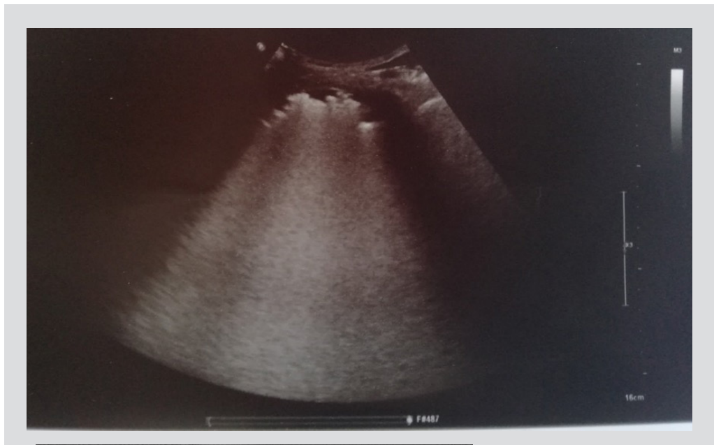
Figure 2. Point-of-care lung ultrasound. The image shows multiple basal consolidations