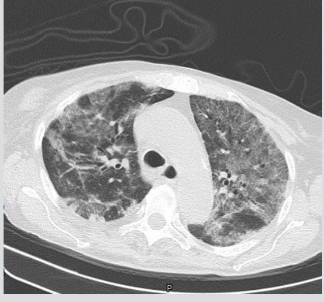
Figure 3. Lung CT scan. The image shows multiple ground-glass opacities and consolidations in both lungs