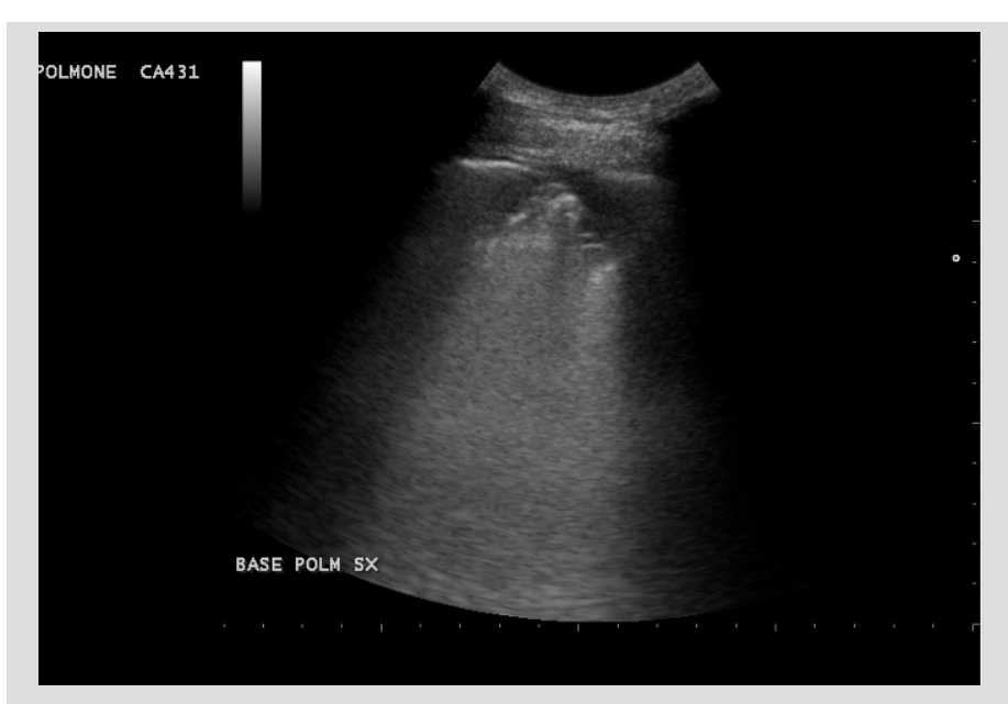
Figure 4. Point-of-care lung ultrasound. The image shows left basal consolidations with slight pleural effusion

Laboratory findings are reported in Table 2 . Interestingly, the SIC score was normal <sup>[3]</sup>. Another nasopharyngeal swab was taken and showed low-positive results. Fondaparinux was immediately started at a high dose and switched to a twice daily regimen of dabigatran after 5 days. The patient was discharged without sequelae on day 6.