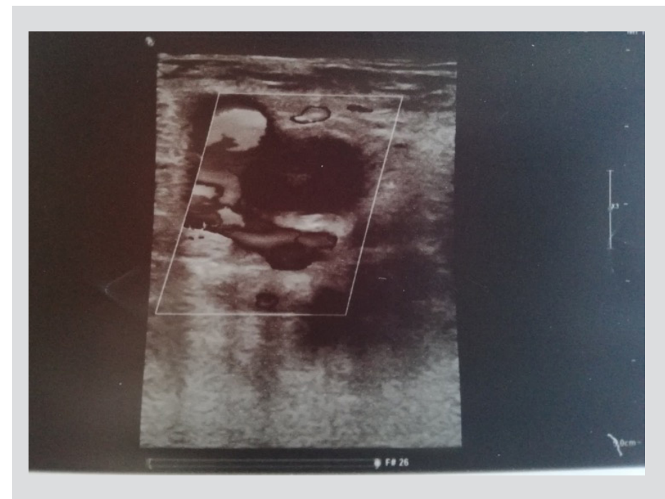
Figure 1. Compression ultrasound shows the incompressibility of the right common femoral vein