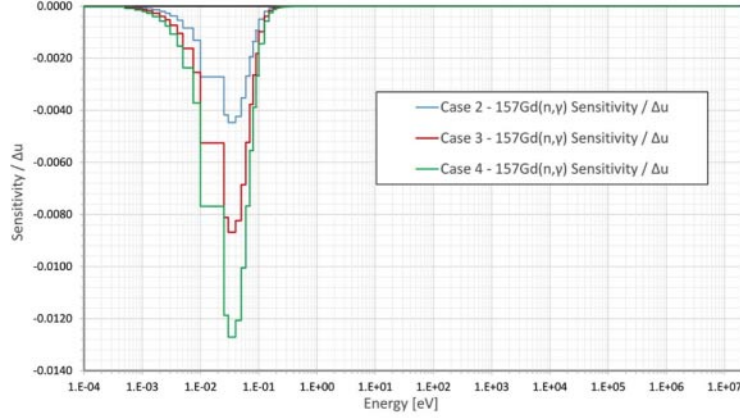
Fig. 2. – ZED-2 k_{\text{eff}} sensitivity per unit lethargy to ^{157}\text{Gd}(n,\gamma) .

ENDF-VII.0 evaluation has been estimated to be, on average, about -3.5\% in the 0.01 to 0.1 eV energy range, and about 2.5\% in the 0.1 to 1.0 eV energy range.