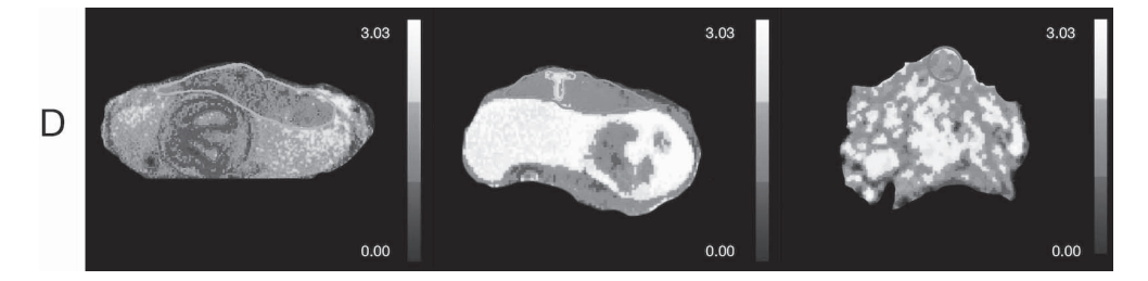
Fig. 1. – Magnetic resonance diffusion maps. The dimension of the colours bar is 10^3 \text{ mm}^2/\text{s} . The first image on the left shows a normal placenta of 22 w GA, whose highest diffusivity is given by the amniotic fluid ( D \simeq 2.710^3 \text{ mm}^2/\text{s} ). The placenta shows different diffusivity given by the cotyledon. On the left side at the bottom there is the umbilical cord characterized by a low diffusivity and high perfusion given by the pressure of the blood. The central image is an FGR placenta of 19.7 w GA. The amniotic fluid has the highest diffusion coefficient. On the top of the placenta there is a T-shaped zone characterized by a high diffusion coefficient, probably due to the anomalous trophoblastic invasion which causes a decreasing of the thickness of the spiral arteries. The third image represents placenta accreta (GA = 28.6 w) characterized by heterogeneous and rugged tissues.