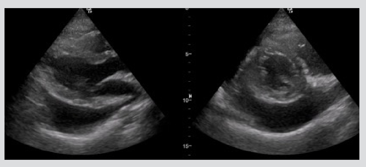
Figure 1. Echocardiogram showing a large pericardial effusion