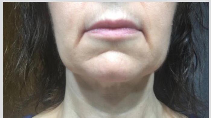
Figure 3. Lymphoedema resolution after surgery

A year after MAL release surgery, the patient had increased hip arthritis, rigidity of hip flexors, and increased lumbar lordosis with a return of many of the original MALS-related symptoms but at lower levels of intensity. A repeated mesenteric ultrasound indicated celiac artery velocity to be elevated during expiration (228 cm/s) and normal during inspiration (102 cm/s), suggesting MALS. The patient then saw an orthopaedic surgeon and elected to have a total hip arthroplasty (THA).