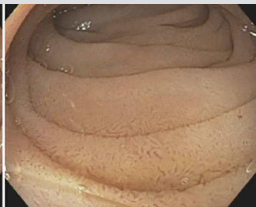
Figure 2. Oesophagogastroduodenoscopy showing scalloped mucosa of the duodenum, an endoscopic feature described in Crohn's disease