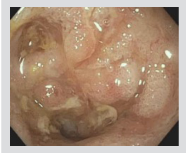
Figure 3. Oesophagogastroduodenoscopy showing nodularity and discoid ulcerations in the terminal ileum consistent with Crohn's disease