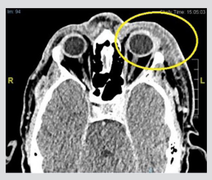
Figure 4. Computed tomography scan demonstrating periorbital swelling, more pronounced on the left side