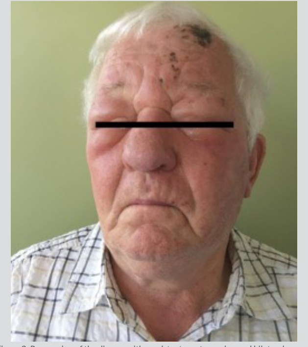
Figure 2. Progression of the disease with persistent crusty erosion and bilateral periorbital erythema and swelling on the day after admission