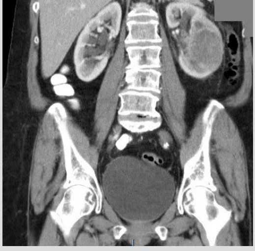
Figure 3. Abdominal CT showing left renal mass

Figure 2.. X-ray of lung cavities and CT of the thorax