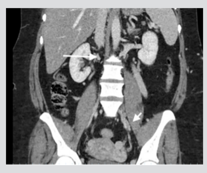
Figure 2.Inferior vena cava atresia (IVCA) of the suprarenal segment. (A) The inferior vena cava is still visible in this slice; however, the azygos (long arrow) and the hemizygos (short arrow) veins are notably dilated. (B) The corresponding axial image in a normal patient (* indicates the suprarenal IVC).

Figure 3. Contrast-enhanced CT scan of the abdomen showed the absence of the infrarenal inferior vena cava (long arrow) with dilated pelvic/iliac collaterals (short arrow)