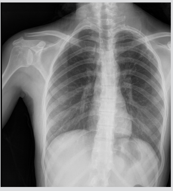
Figure 2. Chest radiography showing opacity projecting from the posterior arch of the first left rib