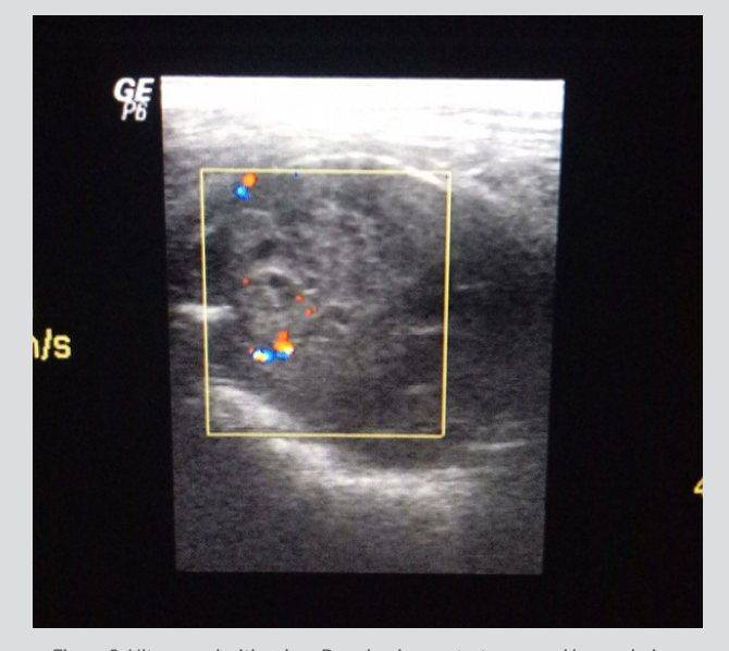
Figure 3. Ultrasound with colour Doppler demonstrates an oval hypoechoic heterogenous lesion showing poor vascularization