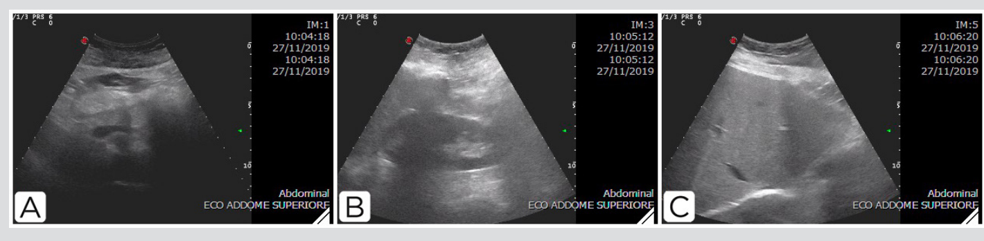
Figure 3. Ultrasound scan on 27 November 2019

On 11 December, the patient started the third-line immunosuppressive therapy with tacrolimus 2 mg daily. On 17 December, she underwent an abdominal CT scan ( Fig. 2B ) which showed progressive disease but no liver involvement. The patient's condition deteriorated and she died on 27 December. Her relatives did not consent to an autopsy.