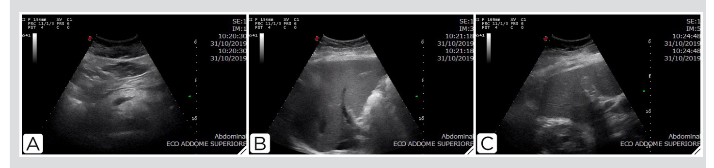
Figure 1. Ultrasound scan on 31 October 2019

In October 2019, the patient started combination immunotherapy with ipilimumab and nivolumab. After 1 week, liver toxicity was reported (grade 2 on aspartate aminotransferase (AST) and alanine transaminase (ALT), and grade 3 on total bilirubin (TB) and direct bilirubin (DB)). The patient then underwent a liver ultrasound ( Fig. 1 ) which was negative for metastasis. She was started on oral prednisone 25 mg (1 capsule) three times a day.