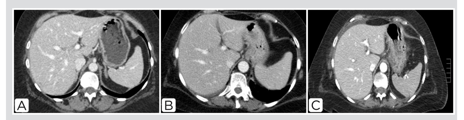
Figure 2. CT scans on 11 November 2019 (A), 17 December 2019 (B) and 23 December 2019 (C)

In November 2019, the patient underwent an abdominal CT scan ( Fig. 2A ) which showed a slightly enlarged liver without focal lesions. Liver enzymes continued to increase without impairment in coagulation function. The patient maintained a fair general condition until the beginning of December 2019.