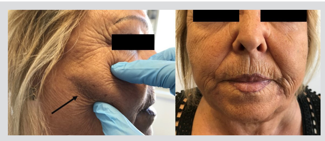
Figure 1. Dermatological findings in facial skin

A 74-year-old woman, with no relevant medical history, was referred to dermatology consultations for evaluation of asymptomatic facial skin lesions with 1 year of evolution. She reported having had an Ellansé® (PCL) implant in a private clinic for cosmetic purposes about 3 months before lesion onset. She had no other associated symptoms, although during follow-up she had complained of myalgia and dizziness. Physical examination revealed four subcutaneous and indurated 2×2 cm nodules, located bilaterally and symmetrically in the lower part of both nasolabial folds and over both zygomatic arches (Fig. 1). Biopsy results revealed chronic granulomatous inflammation, with multinucleated giant cells affecting the adipose panniculus (Fig. 2). Staining for microorganisms and microbiological studies were negative and the diagnosis of sarcoid granulomas was made by the dermato-pathologist. A haemogram, immunoglobulin tests and chest x-ray did not show any notable findings. Angiotensin-converting enzyme (ACE) was slightly elevated (20 IU/I), as was ESR (30 mm/h). The Mantoux intradermal test and IGRA were negative. Therefore, a head, neck and chest CT scan was performed, which showed large adenopathic conglomerates in all mediastinal compartments, compatible with sarcoidosis, and without alterations in the lung parenchyma.