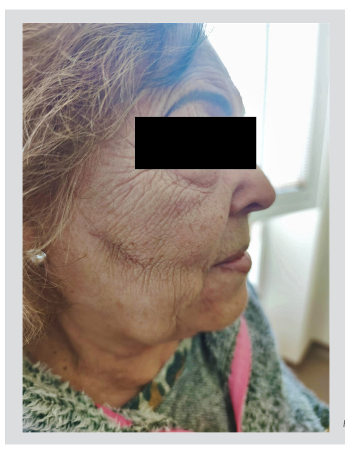
Figure 3. Dermatological findings after methotrexate