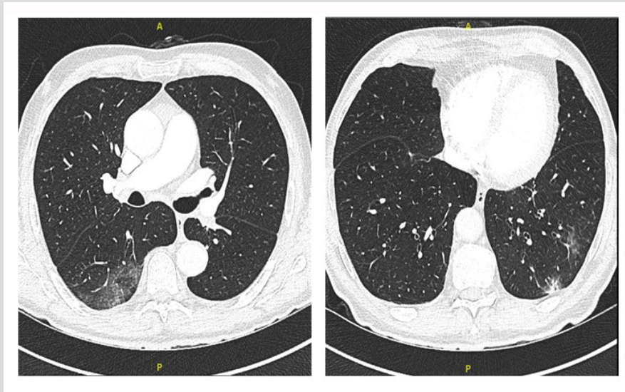
Figure 1. CT of the thorax: ground glass opacities are seen in the left and right lower lobes affecting 4% of the total lung volume

Six months after recovery from COVID-19, the patient received the first dose of the mRNA-1273 SARS-CoV-2 vaccine (Moderna®). A few hours after vaccination, he developed fever, fatigue, nausea, diarrhoea and myalgia. Myalgia increased over the next few days and he presented to the emergency department 4 days after vaccination. On admission, he was afebrile (37.1°C) with a blood pressure of 131/77 mmHg, a pulse of 76 bpm and an oxygen saturation of 97% on room air. The physical examination was unremarkable with no signs of a local injection site reaction. He had mildly elevated C-reactive protein and normal white blood cell counts (Table 1). A nasopharyngeal swab was negative for SARS-CoV-2. SARS-CoV-2 serological testing was positive for nucleocapsid SARS-CoV-2 IgG/IgM (Elecys® Anti-SARS-CoV-2 N Test) with a titre of 78.7 multiple of cut-off (cut-off 1.0). We suspected a severe prolonged systemic reaction to the mRNA-1273 SARS-CoV-2 vaccine after natural immunization due to COVID-19 infection 6 months before, and discharged him with symptomatic therapy. The patient reported total recovery 2 days later.