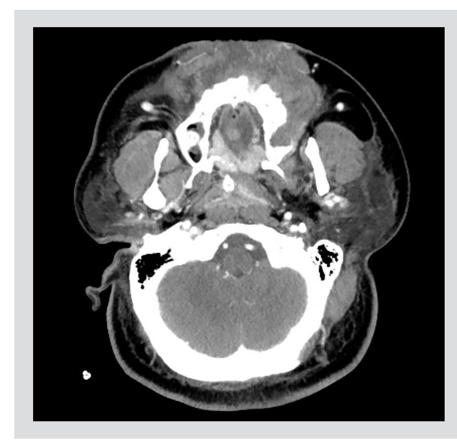
Figure 2. Computed tomography scan (CT scan) of the head. There is extensive subcutaneous stranding and swelling throughout the periorbital region, face and neck