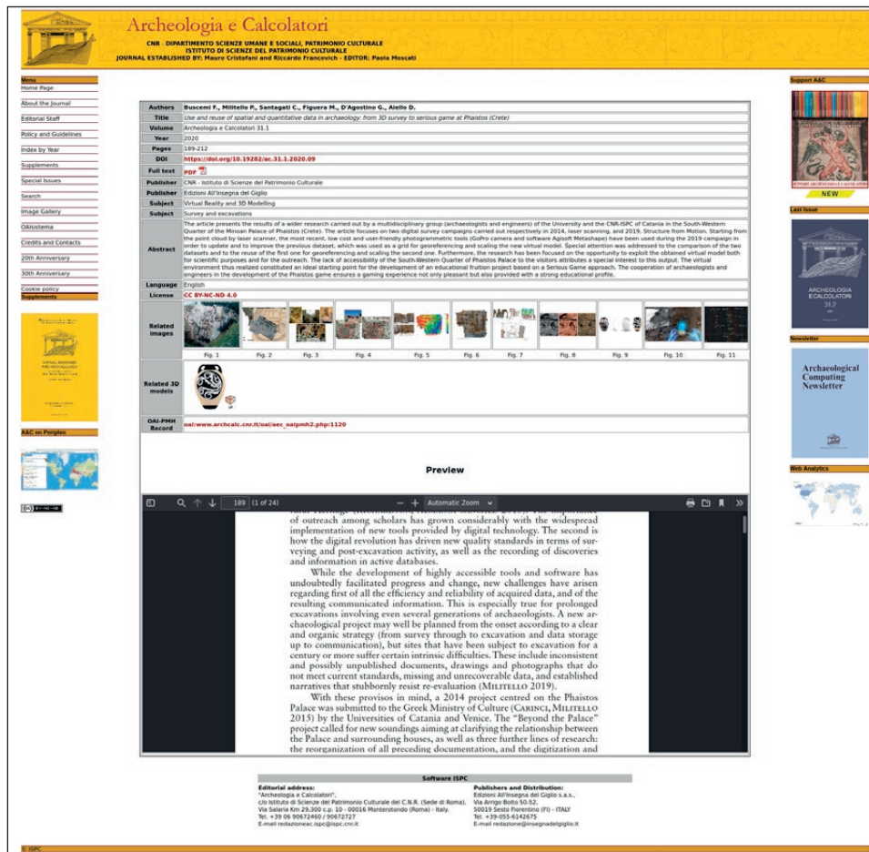
Fig. 6 – New web page for the presentation of «Archeologia e Calcolatori»'s article data.

results of these adaptations (the same article used for the example records in section 2). The article contains 11 figures, which were all uploaded to the database with the corresponding metadata. It also references a 3D model, described in paragraph 3.4. The results are shown in Fig. 6.