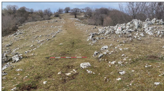
Fig. 5 – Road to Sublacio from Carsulis , an image of the archaeological evidence of the road mapped in the Tabula Peutingeriana (P. Rosati 2021).