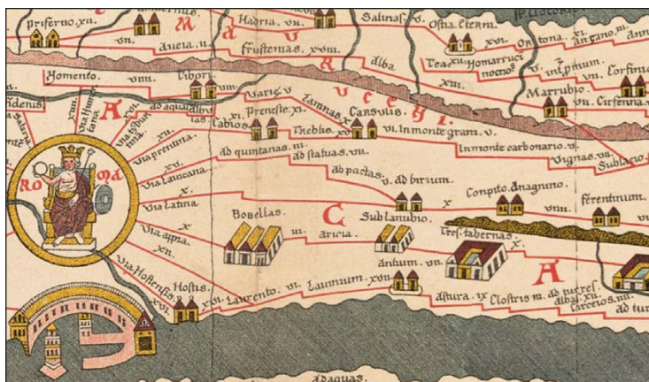
Fig. 2 – The Tabula Peutingeriana and the “Road to Alba”.

Anio valley, at Sublacium : Carseoli-in mons Grani (7 milia)- in mons Carbonario (5 milia)- ad Vignas (5 milia)- Sublacium (7 milia)- Marrubio-Alba (13 milia).