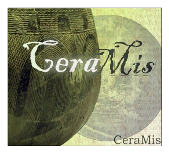
Fig. 1 – Logo of the CeraMis software.

<sup>1</sup> http://www.ace.hu/daad/daad2/; http://www.ace.hu/daad/daad3.